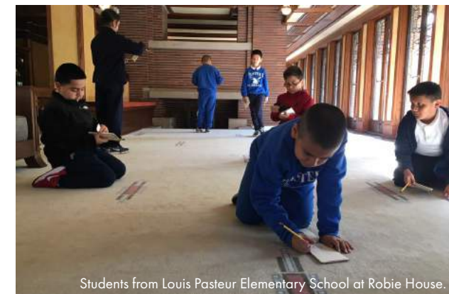
Students from Louis Pasteur Elementary School at Robie House.