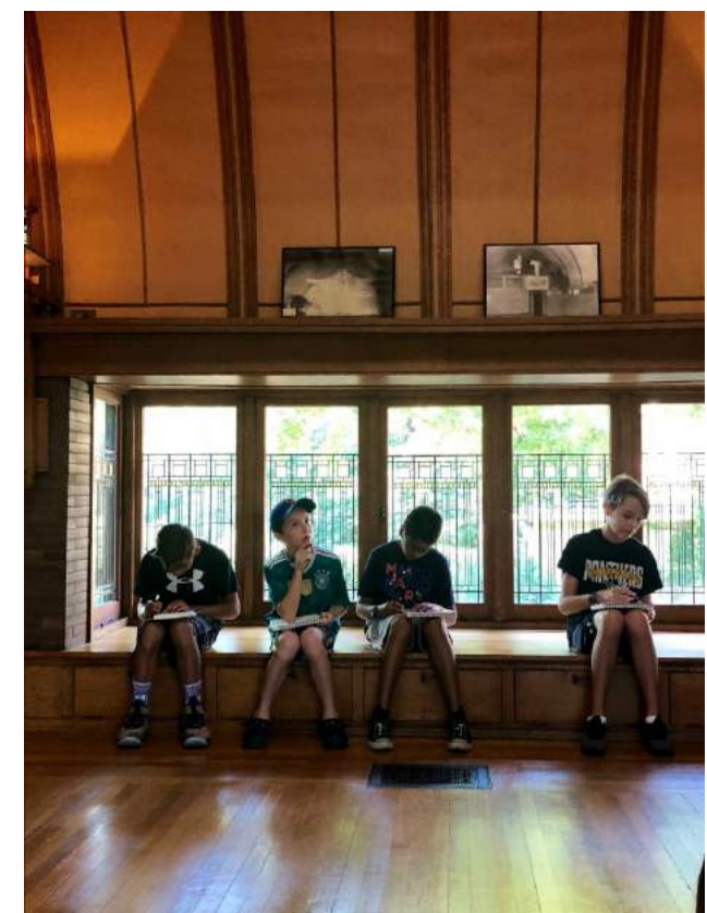
Home and Studio summer camp participants.