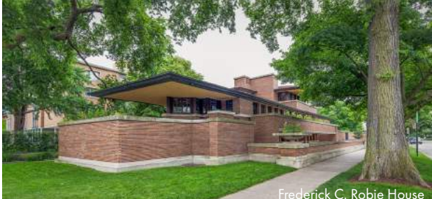
Frederick C. Robie House