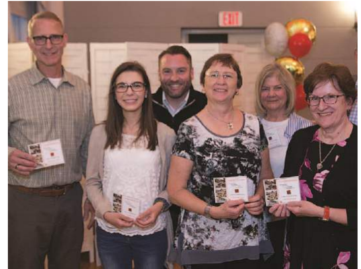
Volunteers receive their pins for five years of service with the Trust.