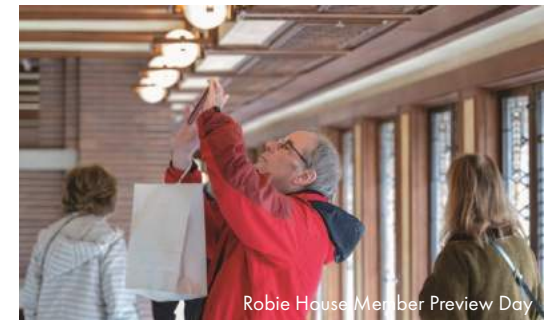
Robie House Member Preview Day