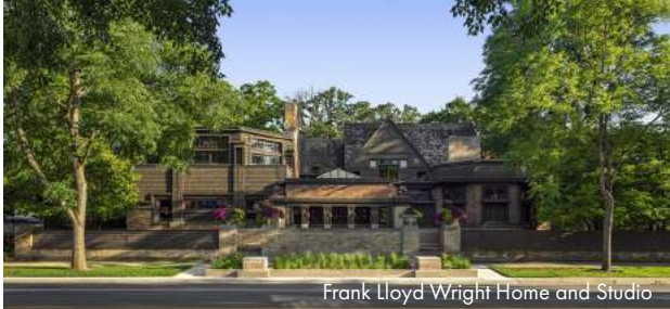
Frank Lloyd Wright Home and Studio