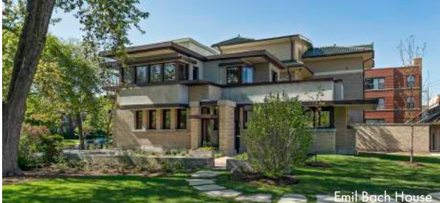
Emil Bach House