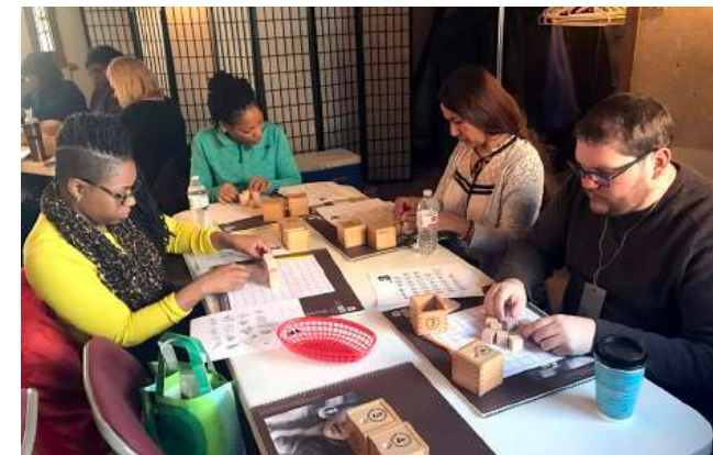
Teachers attend professional development.