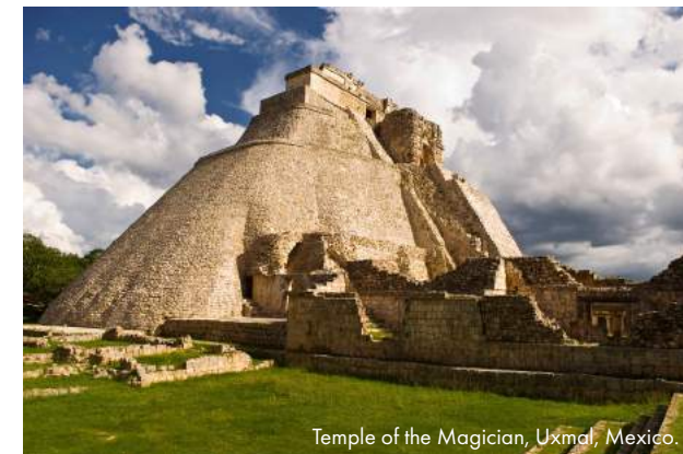
Temple of the Magician, Uxmal, Mexico.