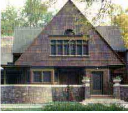
Frank Lloyd Wright Home and Studio 951 Chicago Ave, Oak Park, IL