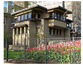
Emil Bach House 7415 N. Sheridan Rd, Chicago, IL

Group tours and program bookings: 312.994.4040 or tours@flwright.org