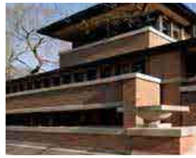
Frederick C. Robie House 5757 S. Woodlawn Ave, Chicago, IL