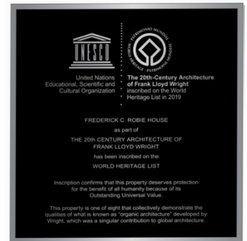
Robie House - World Heritage Plaque

The plaque reads: FREDERICK C. ROBIE HOUSE as part of THE 20TH CENTURY ARCHITECTURE OF FRANK LLOYD WRIGHT has been inscribed on the WORLD HERITAGE LIST. Inscription confirms that this property deserves protection for the benefit of all humanity because of its Outstanding Universal Value. This property is one of eight that collectively demonstrate the qualities of what is known as “organic architecture” developed by Wright, which was a singular contribution to global architecture.