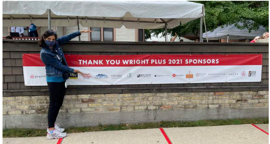
We are grateful to all the Wright Plus 2021 sponsors.