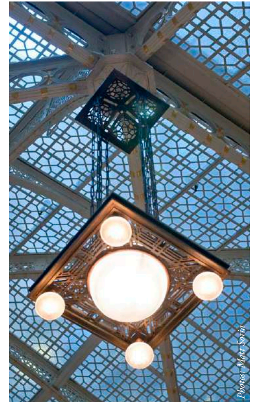
The Rookery Light Court, Frank Lloyd Wright, Suspended Light Fixture.