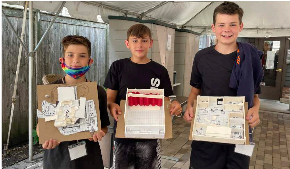
Participants of Sound and Space: Designing with Architecture and Music , a weeklong summer camp in Wright's Studio.