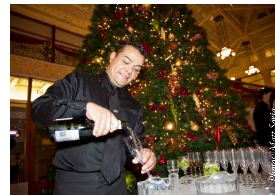
Wright Night at The Rookery Building