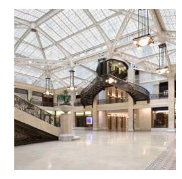
Rookery Light Court 209 S. LaSalle St, Chicago, IL