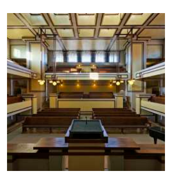
Unity Temple 875 Lake St, Oak Park, IL