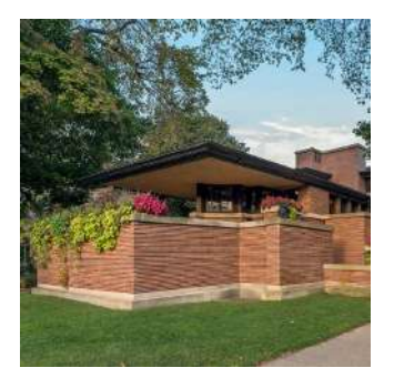
Frederick C. Robie House 5757 S. Woodlawn Ave, Chicago, IL