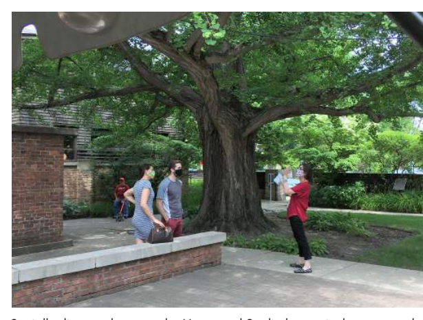
Socially distanced tours at the Home and Studio began in the courtyard